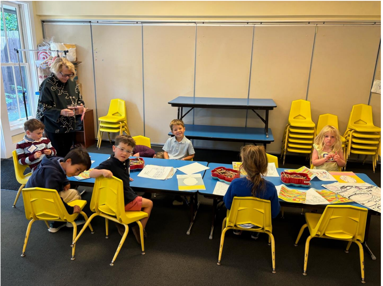
Photo from St. Mary's Sunday School Class Sunday, September 8, 2024.

Newcomers and visitors, we welcome you warmly. May you find here, by the grace of God, that which feeds your soul. May you leave here with a heart prepared to serve.